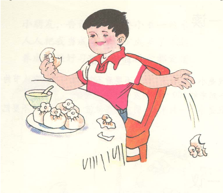
1.1 waste food: eat the meat filling and throw away the buns