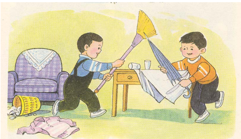
1.2 improper use of goods: fight with an umbrella and a broom