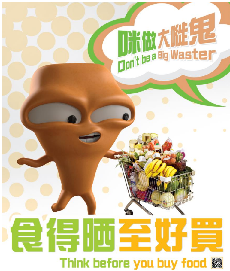
Figure 1. Big Waster Poster