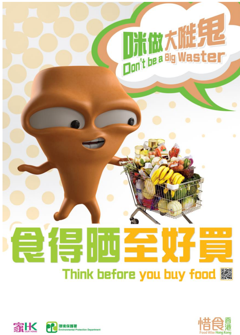
Figure 1. Big Waster Poster

Use by permission of Environmental Protection Department