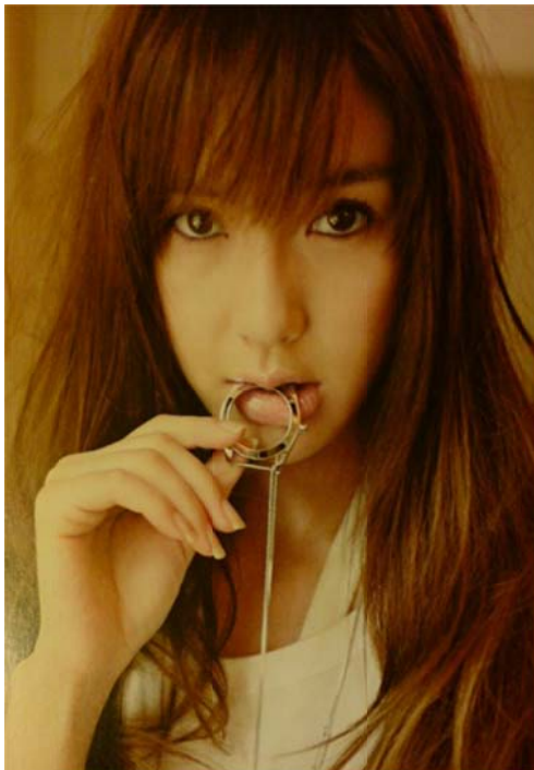
Figure 2. "A Chinese person will consider her sexy".