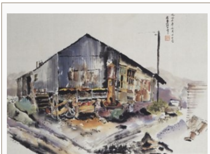
Fig. 3: Fay Chong (1912–1973), Uncle Post’s Warehouse , 1947, watercolor on paper, Collection of Priscilla Chong Jue, © Fay Chong

23 Andrew Chinn’s work truly shines, though, in purer landscapes, studied either in one of Washington’s lush national forests or one of Seattle’s many urban retreats. “Nature nourished him in every way: emotionally, mentally, physically and spiritually” (Beers). In Seward Park ( an area in southeast Seattle ), Chinn delineates tree shadows and the edges of the hilly terrain with needle-thin lines of Chinese ink, but delicately feathers the brushwork when suggesting birch tree leaves softly waving under a typically overcast Northwestern sky (Fig. 4).